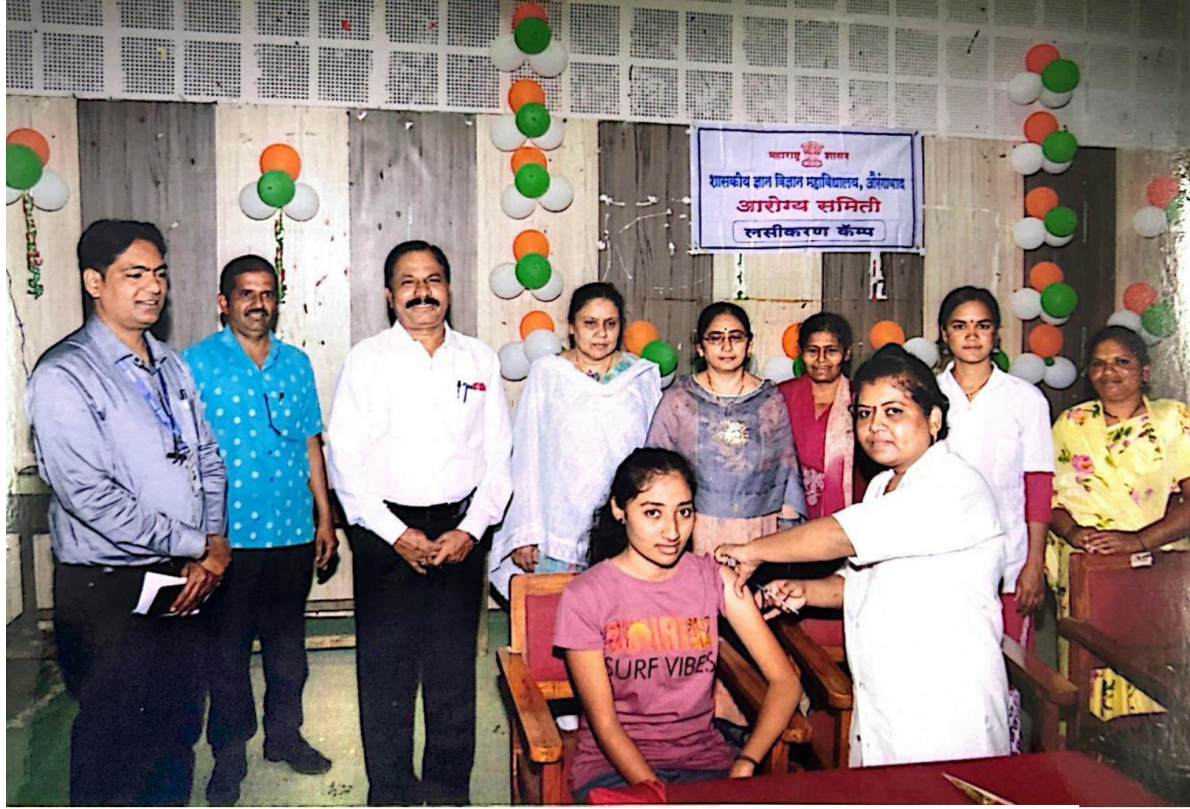
Vaccination camp 27 April 2022