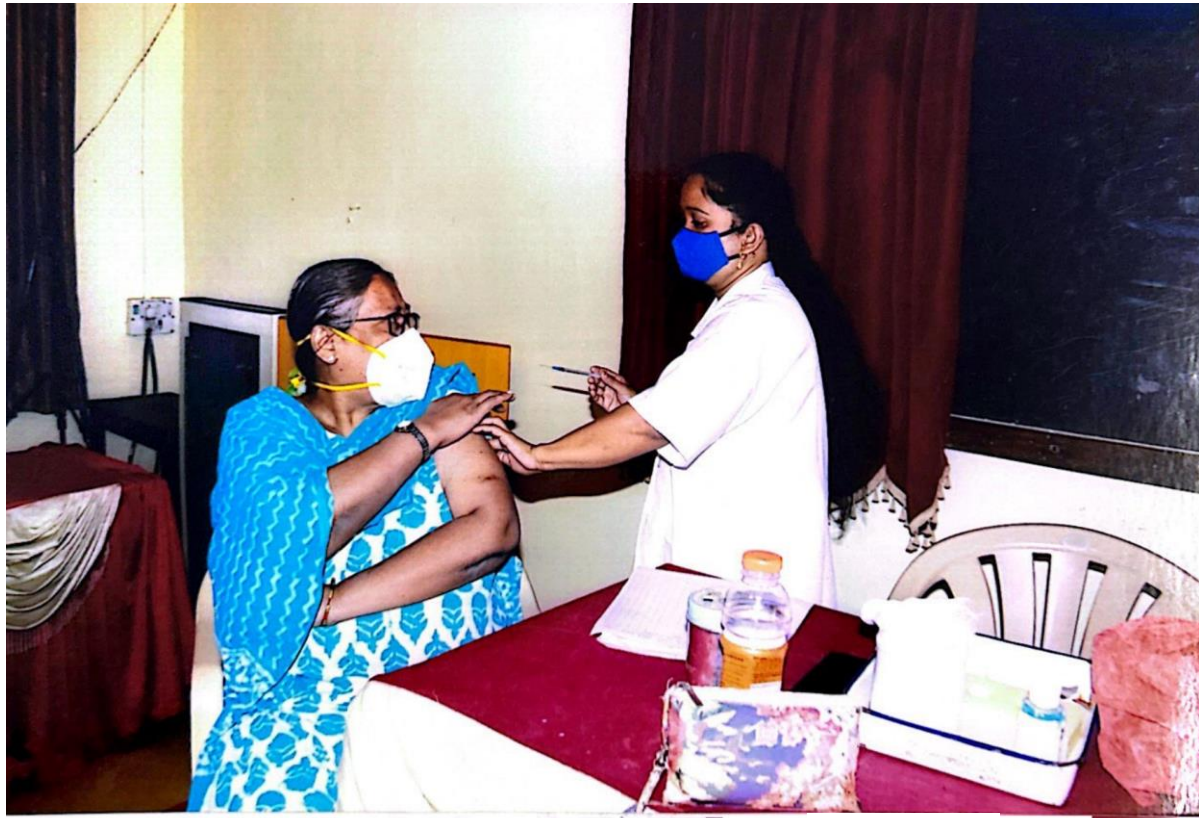
Vaccination camp 27 April 2022