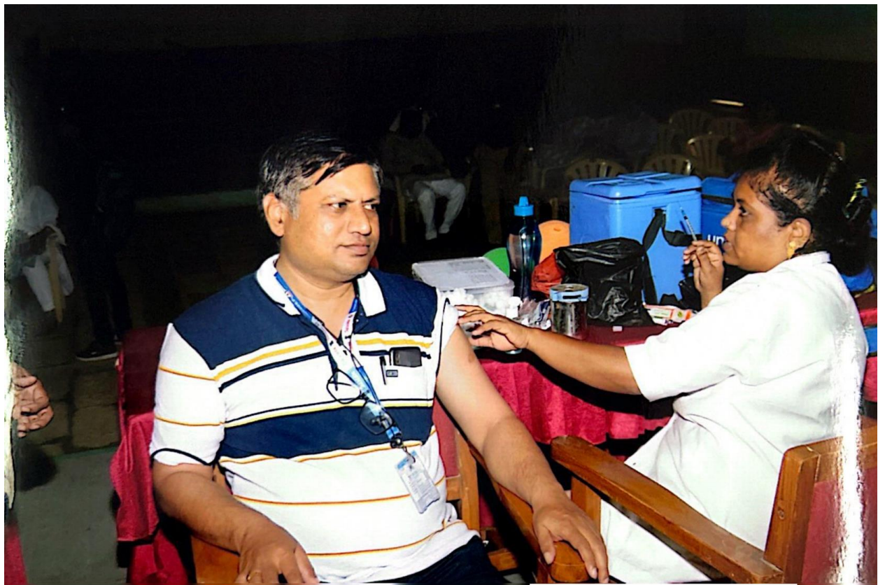
Vaccination camp 27 April 2022