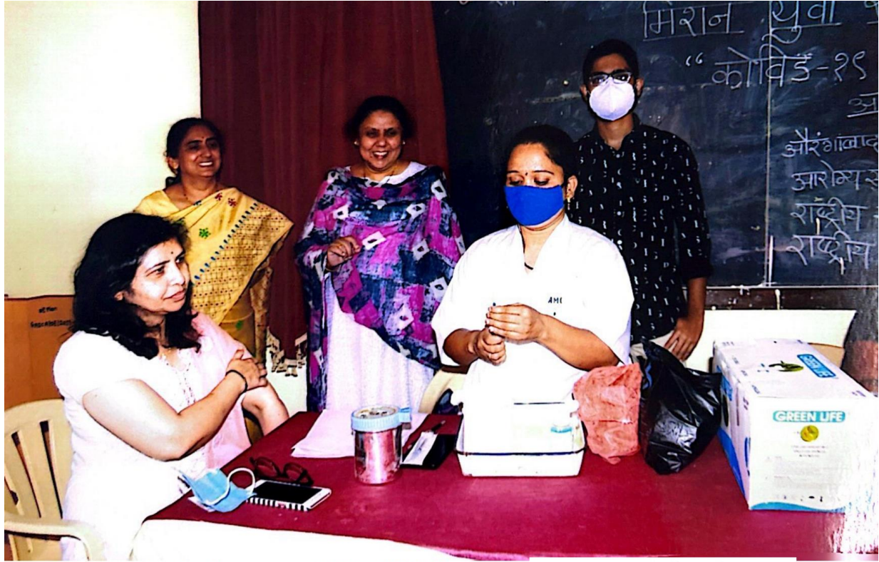
Vaccination camp 27 April 2022